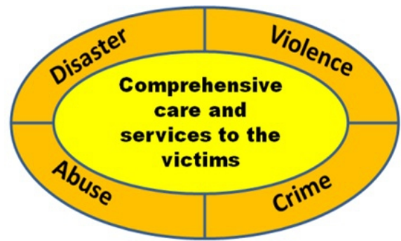
Figure 1: Roles and Responsibilities of Forensic Nurse

Forensic nursing is an indispensable and growing field within healthcare that combines medical expertise with forensic