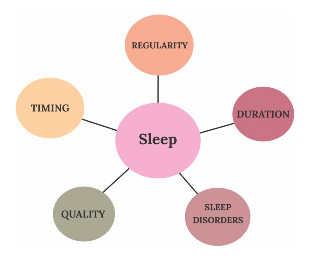
Figure 1: Different factors affecting sleep

and exacerbate existing health conditions [6].